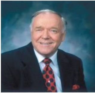
Dr. Kenneth E. Hagin